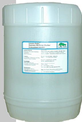
5 gallon container