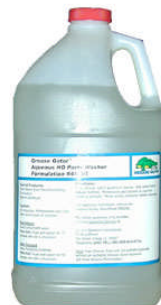
1 gallon container