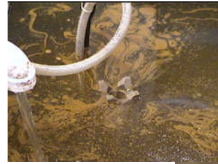
Skimmer vacuums in contaminant