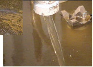
Clean & purified output stream after purification