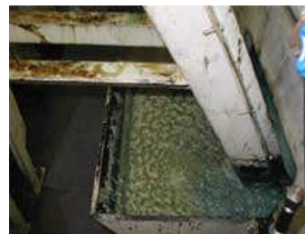
Sump before PuriGator