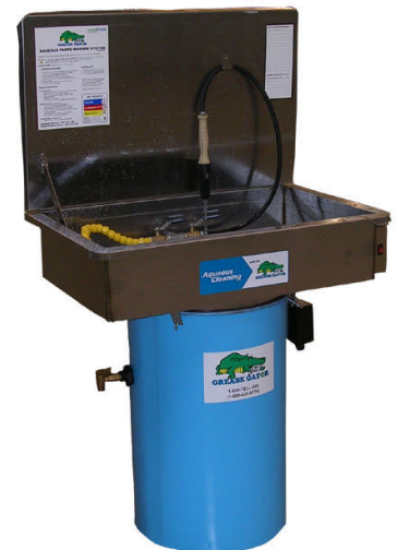
Grease Gator Elite