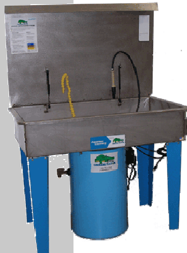
Grease Gator Elite 48" handles large parts.