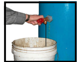
Empty Oil Collection Reservoir with a twist of a valve.. Oil is directly ready for reuse/recycling.