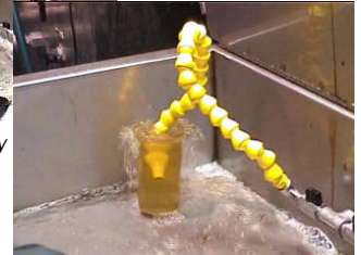
. . . and the cleaning solution stays clean. The Power of Grease Gator Purification.